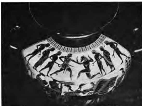
Fig. 79. Theseus killing the Minotaur.

carrying with him on his ship his benefactress Ariadne. On the island of Naxos, however, he deserted his bride while she slept,—some say because he loved some one else and wanted to get rid of her, others, because he was warned to leave her there to become the wife of Dionysus. Perhaps it was in requital of his faithlessness to